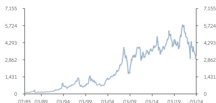
■ Class A (USD) Dis.