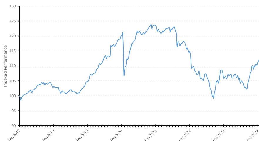
A USD (Acc)